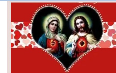
JESUS: THE SACRED HEART AND MARY: THE IMMACULATE HEART